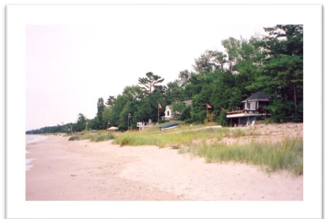
A photograph taken at the same beach in 2005, showing the development and expansion of dunes during low water levels

Coastal assets not only include the built environment (e.g. development, buildings and structures), but natural assets that sustain the healthy functioning of the coastline (e.g. wetlands, dunes, bluffs and beaches).