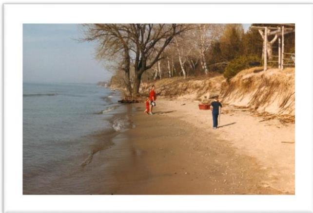
A photograph taken along Lake Huron's shoreline in 1986 showing erosion during a period of high water levels

To protect coastal assets, experts suggest that the full historic extent of high and low water levels should be considered as possible when defining the potential range of variation that coastal communities could experience in the future (International Upper Great Lakes Study 2012). This includes designing coastal infrastructure to specifications that consider the extreme ends of the water levels spectrum. In other words, we need to prepare for both high and low water levels in waterfront design. In addition, more frequent and intense precipitation and storm waves could lead to beach erosion and dune cliffing.